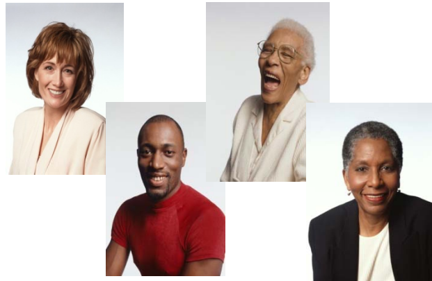
Provide Customer Satisfaction