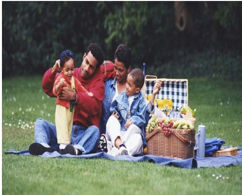
Protect Public Health