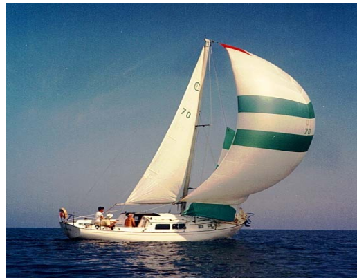
Upgrade Water Quality & Improve Our Environment